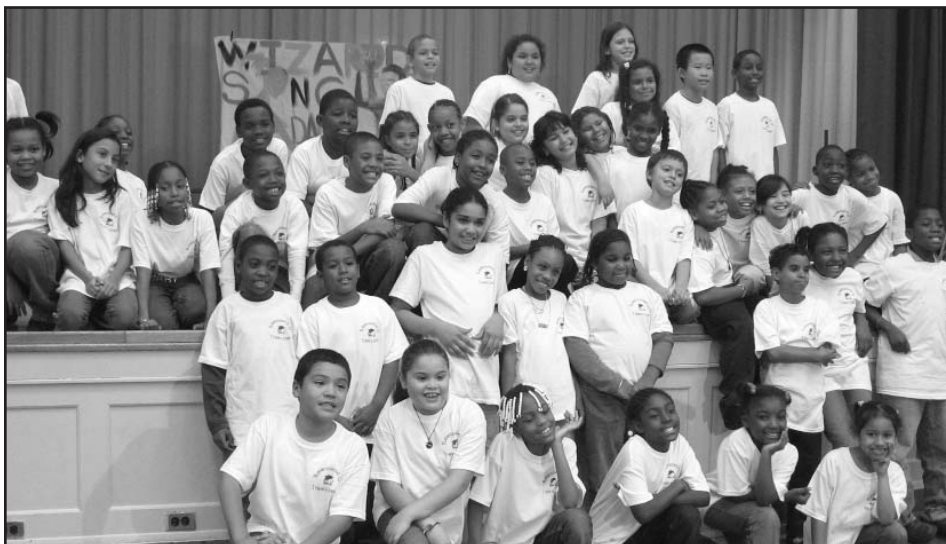
This group of third and fourth graders from the Ravenswood II IHAD Program is all smiles at their kickoff event on November 9, 2006.