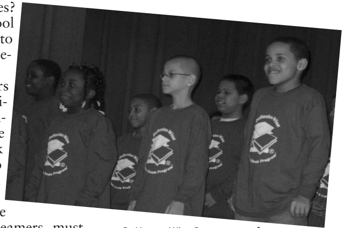
DeHostos-Wise Dreamers perform in celebration of Black History Month.

The best part is that art promotes flexibility within any discipline, whatever genre it may be. By using the arts, our Dreamers can create, learn, develop life skills, discover new things about themselves, interact with others, and have a lot of fun.