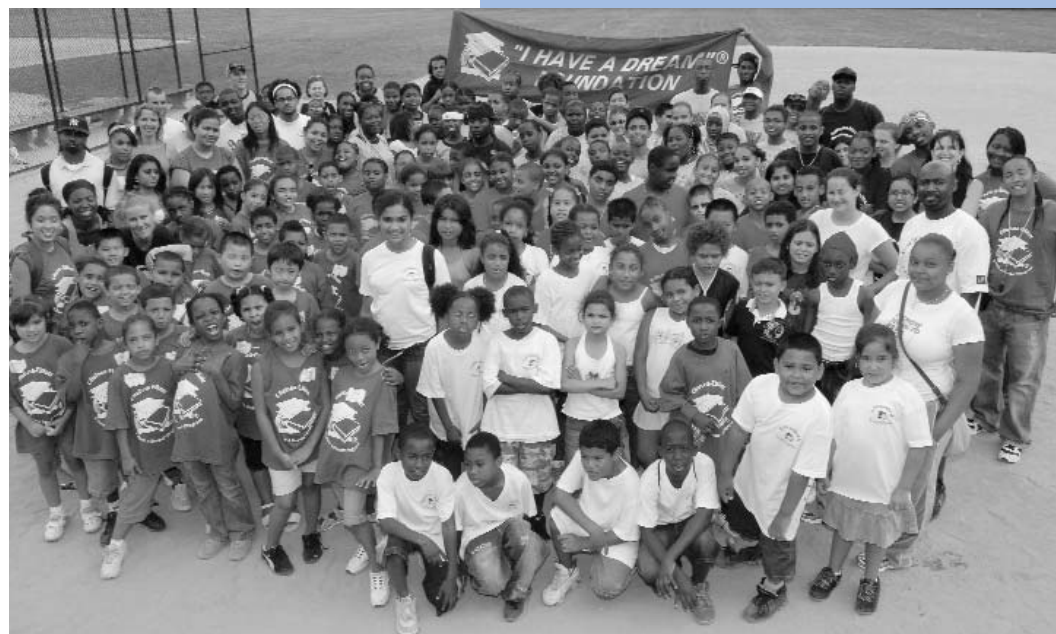
Right: Dreamers and staff from across IHAD-NY Metro come together on Dreamer Field Day.

Special thanks go out to all of the Summer Youth Employment Program Workers (SYEP) who worked at the IHAD-NY Metro programs throughout the summer. Many of these volunteers were our own Melrose I Dreamers, who got some important employment experience, and at the same time became mentors for the younger Dreamers.